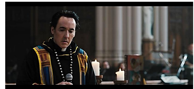
The Book of Gospels seen in Spike Lee's movie Chi-Raq . 2015.