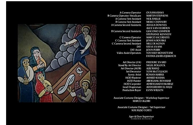
1 of 6 images used in National Geographic documentary The Story of God with Morgan Freeman , 2016.